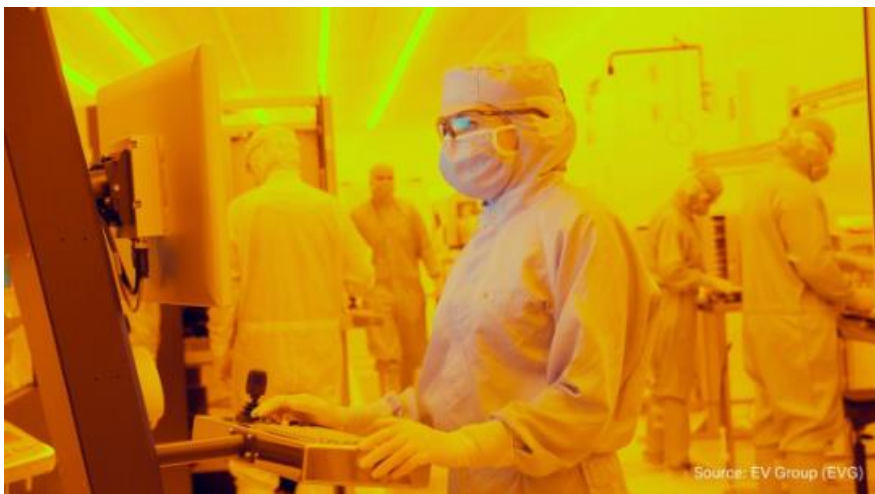
EV Group launches EVG S&R Mastering Shop™ at corporate headquarters.

EV Group (EVG), a supplier of wafer bonding and lithography equipment for the MEMS, nanotechnology, and semiconductor markets, today announced that it has established the EVG Step-and-Repeat (S&R) Mastering Shop, a new service offering to help customers accelerate the deployment of nanoimprint lithography (NIL) in high-volume manufacturing. The EVG S&R Mastering Shop uses EVG's own equipment and cleanroom facilities to provide contract manufacturing of large-area master templates and stamps, which are used to produce working stamps for wafer-level and panel-level NIL processing. By eliminating the capital costs associated with owning dedicated S&R systems for master stamp fabrication, customers can more easily integrate NIL technology in their new product designs. Devices and applications benefiting from EVG's S&R NIL solutions include augmented reality waveguides, advanced micro-optics for optical sensors, micro-lenses, nanophotonics and silicon photonics. The EVG S&R Mastering Shop is a key addition to EVG's NILPhotonics Competence Center framework, located at EVG's corporate headquarters in Austria.