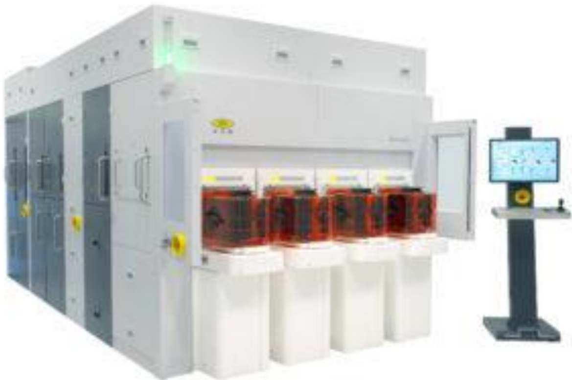
GEMINI@FB integrated fusion bonding system.

“Hybrid bonding requires substantially different manufacturing technologies to standard packaging processes, bringing it much closer to front-end manufacturing – especially in terms of cleanliness, particle control, alignment and metrology precision,” stated Dr. Thomas Uhrmann, business development director at EV Group. “In line with our market leadership for W2W hybrid bonding, we continue to expand our D2W hybrid bonding solutions and optimize our equipment to support critical upstream and downstream processes, such as plasma activation and cleaning, in order to accelerate the deployment and maturity of D2W hybrid bonding. Between our established GEMINI FB, which has been configured for collective D2W integration flows and serving the needs for D2W bonding for several years already, the EVG®320 D2W die preparation and activation system for direct placement D2W bonding, which provides a direct interface with D2W bonders, and the EVG®40 NT2 overlay metrology system, which uses AI, feed-forward and feedback loops to further increase hybrid bonding yields, EVG provides a complete end-to-end hybrid bonding solution to accelerate the deployment of 3D/heterogeneous integration.”