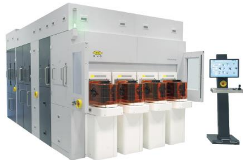
GEMINI ® FB integrated fusion bonding system.

virtual reality and 5G all require the development of high-bandwidth, high-performance and low-power-consumption devices without increasing production cost. As a result, the semiconductor industry is turning to heterogeneous integration — the manufacturing, assembly and packaging of multiple different components or dies with different feature sizes and materials onto a single device or package — in order to increase performance on new device generations. D2W hybrid bonding is a key manufacturing technology for heterogeneous integration. Yet, as